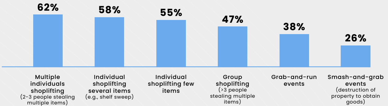
Percent who say the following types of theft or crime are more of a concern than they were a year ago

Underlying all of this is the ongoing challenge posed by organized retail crime: More than three-quarters (76%) of those surveyed say that ORC shoplifting has grown as a concern in the last year. Unlike need-driven shoplifting, ORC typically involves a criminal enterprise employing a group of individuals who steal large quantities of merchandise from a number of stores and a fencing operation that converts the stolen goods into cash.